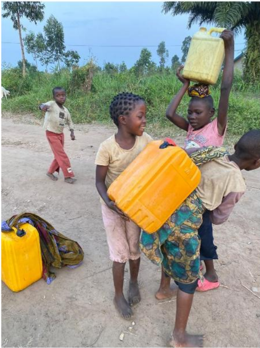
The children happily carry the large, heavy containers filled with water on their backs,