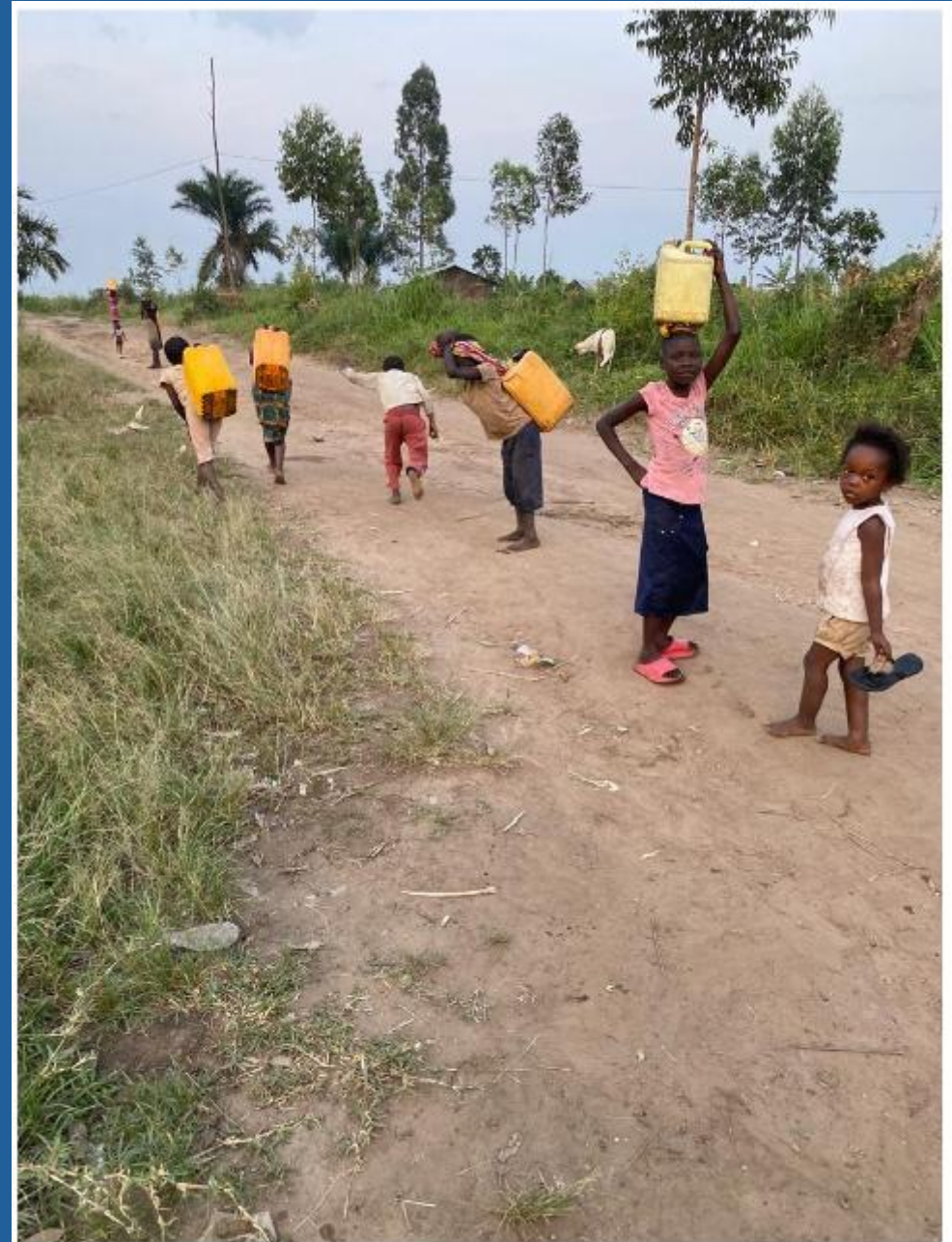
Or balanced on their heads.